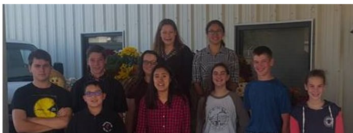
Some of the youth getting ready to work the auction.